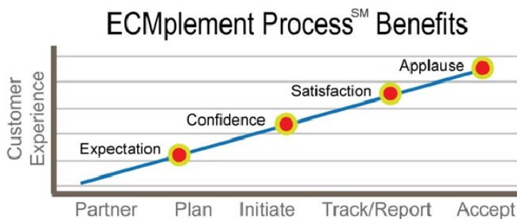
Image API’s ECMplement Process SM ensures success with experienced project management and guidance. Plus, as a single-source provider, Image API installs and supports the system and offers document imaging, output, load, and data migration services.

Image API follows ANSI/AIIM industry standards to ensure your digital documents are as useful and legally recognized as any hard copy versions.